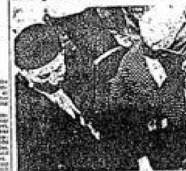
Former King Carol of Romania and Mrs. Elena Lupescu were shown the U. S. American board for Cuba and Mexico in May, 1941. A member of Carol's household in the U. S. and wife were recently married at their hotel Copacabana Palace with JAP Wirephoto.